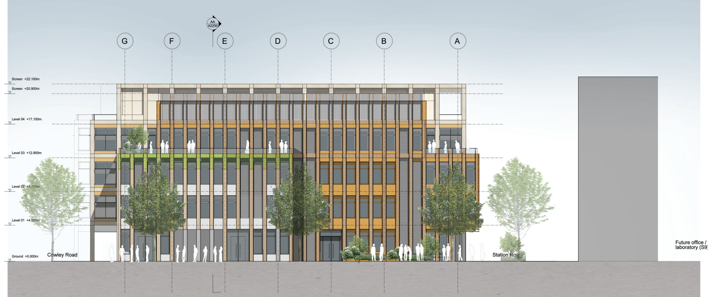
3 Station Row S7 laboratory

Illustrative rendered elevation - please note planting is indicative, refer to landscape architect's plans for location and details