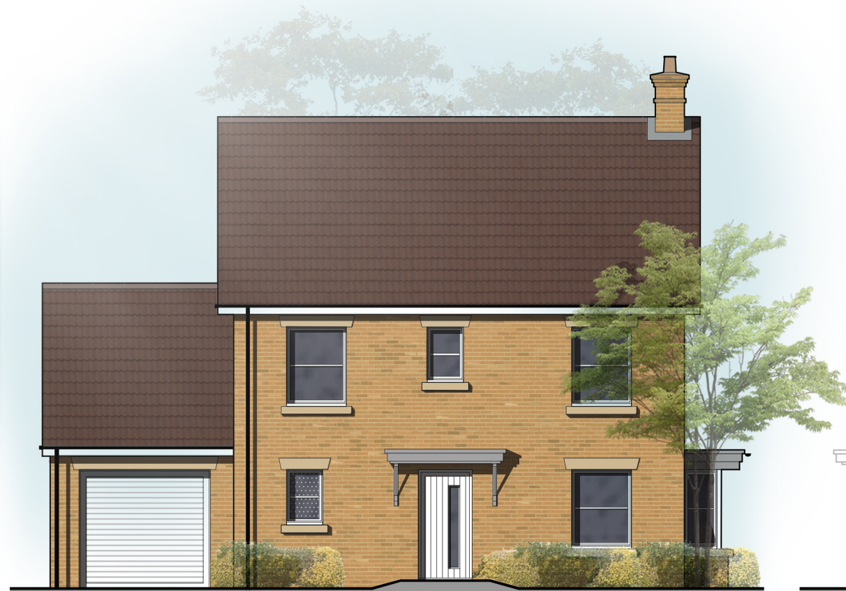
FRONT ELEVATION VARIANT WITH BAY TO PLOTS 68 & 77 ONLY