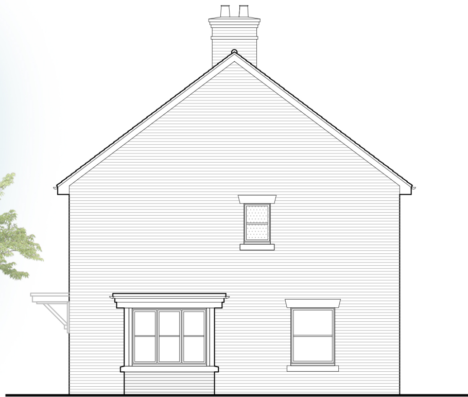
SIDE ELEVATION 1 VARIANT WITH BAY TO PLOTS 68 & 77 ONLY