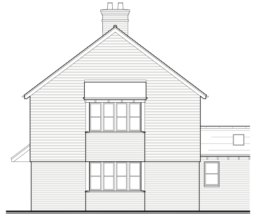
SIDE ELEVATION 1 WITH BAY WINDOW OPTION - FEATURE GABLE (PLOT 40)