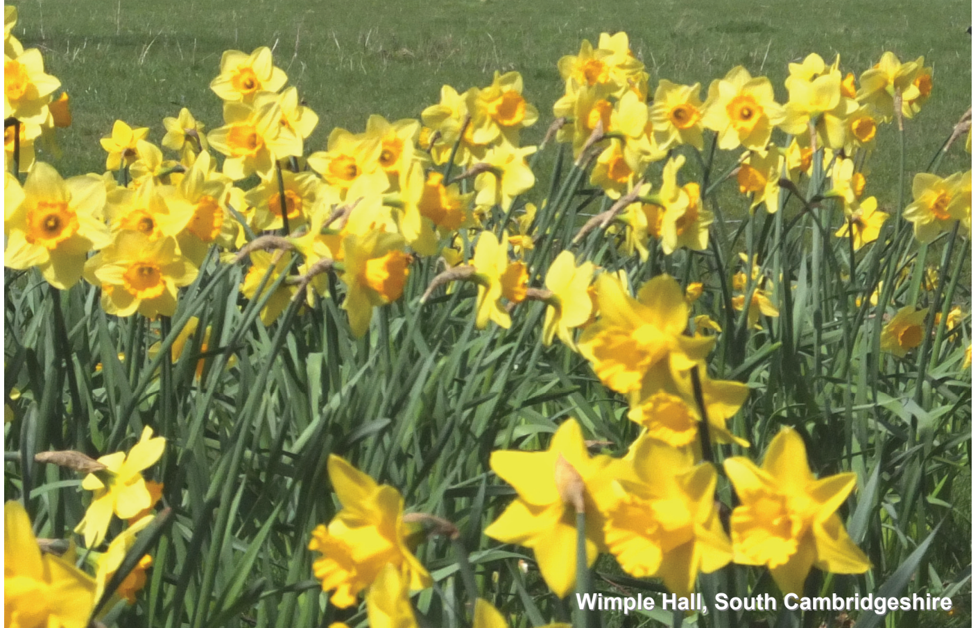
Wimple Hall, South Cambridgeshire